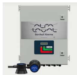
SONIHULL Part of Alfa Laval